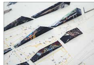
Archival prints and acrylic colours on an archival board

vertically due to the lack of space. Earlier, people who lived in chawls and old buildings had their own culture and way of living. Now, a new culture has been superimposed on that way of life," he says, adding "Ironically, this is called redevelopment. Since I have been displaced a couple of times, and I have been largely affected by the issues of growth and urbanisation, I thought it was necessary to address these