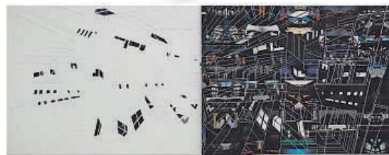
Archival prints on an archival board